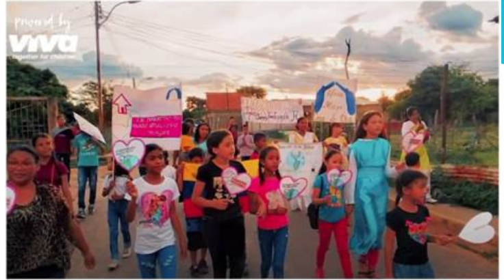
1Amerika y'Epfo 2024

Murizo nyigisho,abana biga bakina.Bashobora kwandika amasengesho yabo ku mashami y igiti bashushanije,bashobora kuyandika ku bipurizo,canke bakandika ku nkaratasi,bashobora no gukoresha amasanamu ya video.